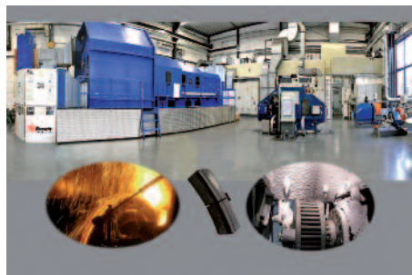
IMPRESSION OF TEST BENCH FACILITIES OF BECORIT

Another important contribution consists of testing and simulation. Becorit proposed a number of simulation programs (such as shuntage or winter testing) which are recognised by the industry and UIC. Very supportive is the advanced test centre that Becorit has at her disposal, comprising for example 3 full and 3 small sized dynamometers, winter simulation, shuntage and thermal imaging. Unique for Becorit is that, within the framework of Euro Rolling Silently, we have also put a lot of effort in referential tests with cast iron blocks and in recycling possibilities for new brake block materials.