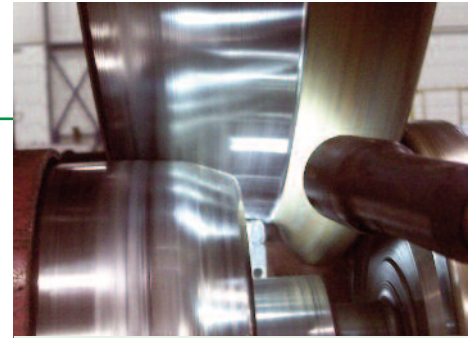
REPROFILING OF WHEEL

the maintenance strategy for wheelsets braked by composite-blocks. Several workshops in Europe have been visited to obtain information on ‘common practice’ for CI-braked wheel maintenance and composite-braked wheel maintenance. Most important question was whether the reprofiling cutting depth can be changed, because this has the largest effect on LCC. In some cases the cutting depth can significantly be reduced compared to the conventional situation (from 6 to 2 mm). In other cases an increase in cutting depth is necessary due to a hard layer on the wheel surface or due to cracks found in the wheel surface. Wheel maintenance procedures are differing per