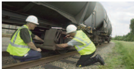
BRAKE BLOCK INSPECTION

A new version of UIC's application guide of LL-blocks will describe the new conditions on the use of LL-blocks. This application guide will be published soon, making a new step in the development and application of LL-blocks. ■